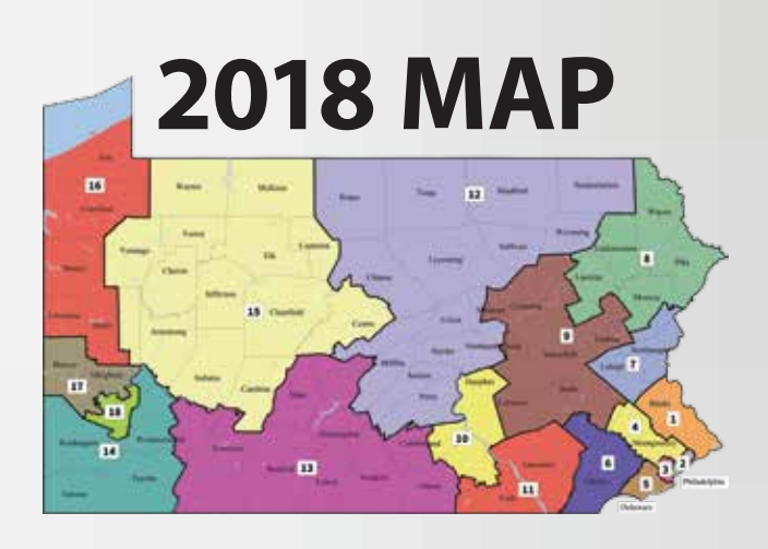
NEW DISTRICT 6